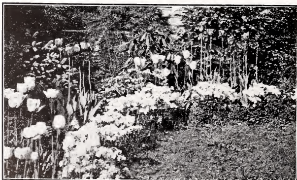
A Bed of Tulips

Princess Marianne. White, slightly tinged rose, large flowers, excellent for bedding. $1.25 for 12; $8.50 per 100.